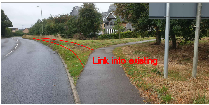
FOOTWAY TYPE 1 WITH EDGE DETAIL F2.

Timber edging 150x25 tanalised softwood board, twice nailed with 50mm galvanised nails to 50x50x400 tanalised softwood pegs driven 25mm below the top of the board at 1m centres